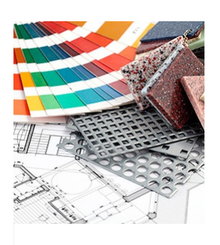
Renovations & Interior design & New builds