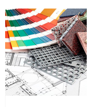
Renovations & Interior design & New builds