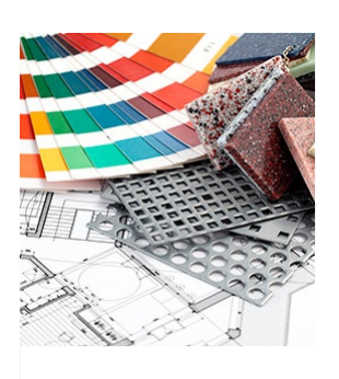
Renovations & Interior design & New builds